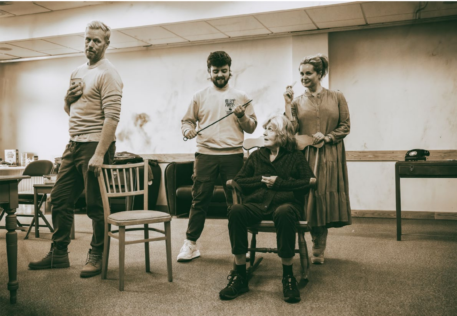
Cast of The Beauty Queen of Leenane in rehearsals.

The Beauty Queen of Leenane is loaded with savage irony, surreal humour and a touch of melodrama.